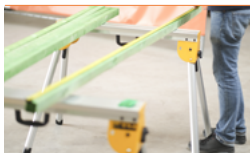
Sawhorses or workbench (for materials) + accessories