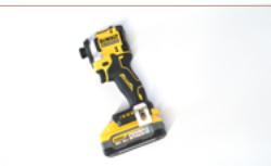
Regular screwdriver or impact drill