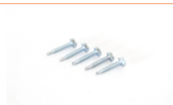
Self-tapping screws (+matching screw bits)