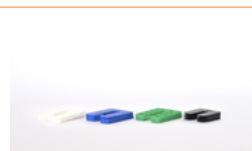
Plastic shims of various thicknesses