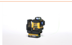
Cross line laser level